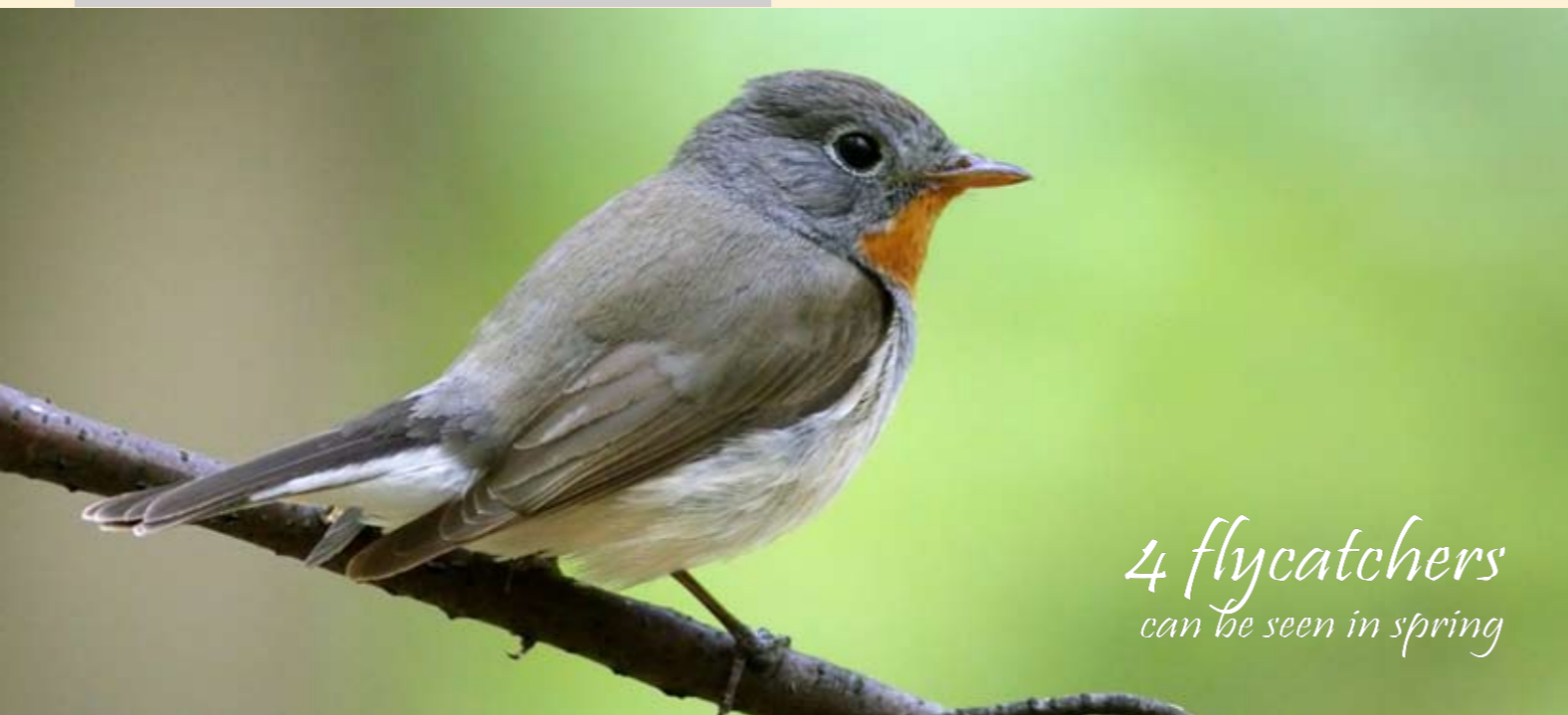
4 flycatchers can be seen in spring

Slovakia is among the longest established birdwatching destinations in Eastern Europe. All Europe's woodpeckers have populations of over 1000 pairs each while owls breed in hundreds of pairs each. The extensive Carpathian mountains offer a fascinating range of forest birds while the plains in the east have little known wetlands and dry areas with Bee-eaters. This tour combines the best examples of habitats ranging from mountain forests and hills to large flat areas with marshes, sand dunes, quarries and fields. Both hotels are set by large artificial lakes with rich littoral vegetation that provide a great habitat for many songbirds. Our local guides have more than twenty years experience of accompanying groups and they help to run the itinerary in the best possible way.