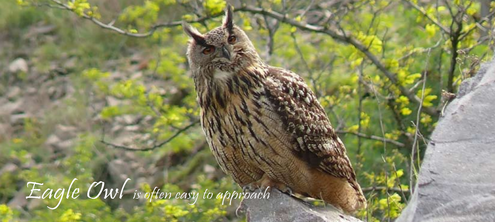
Eagle Owl is often easy to approach