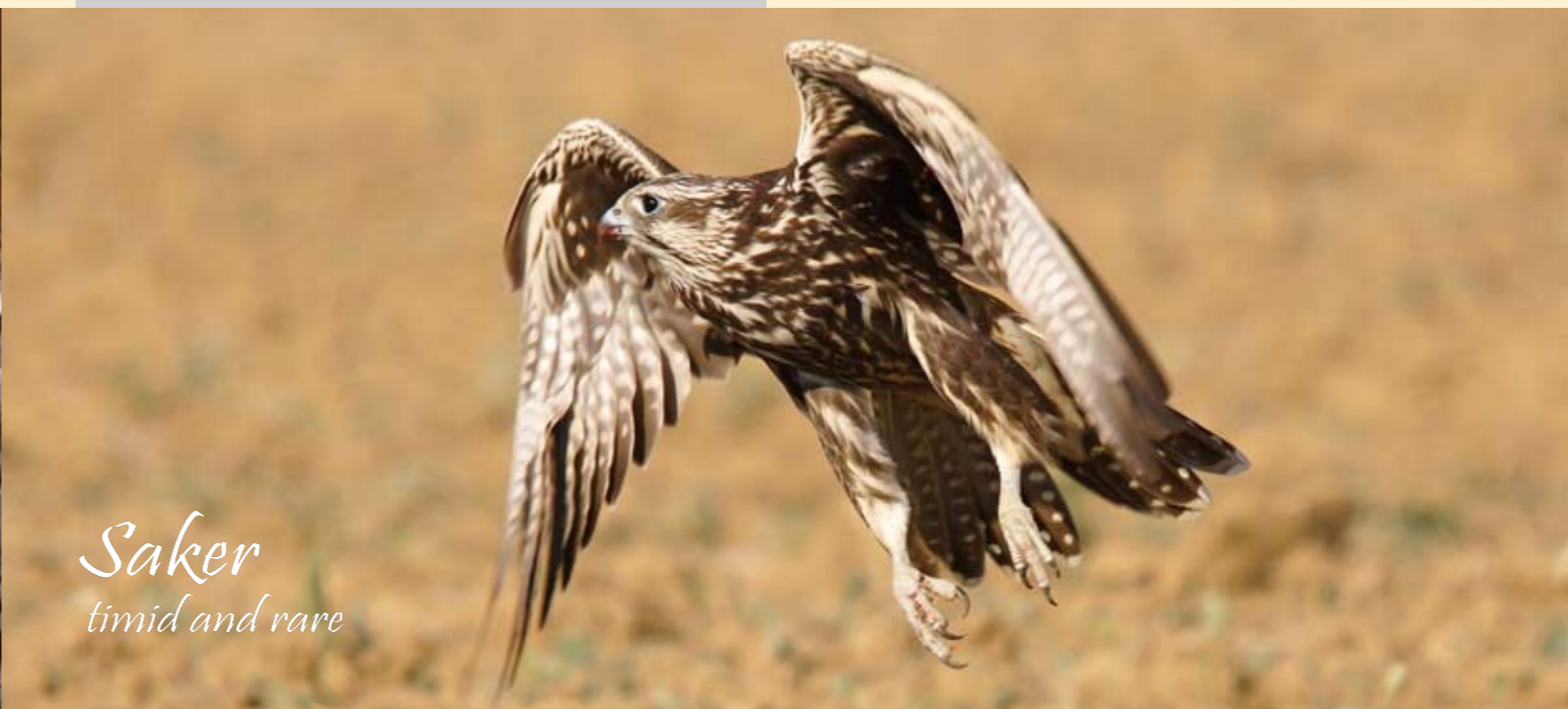
Saker timid and rare