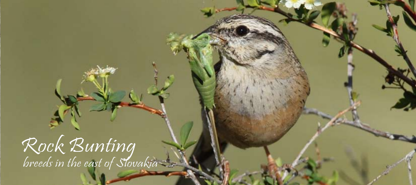
Rock Bunting breeds in the east of Slovakia