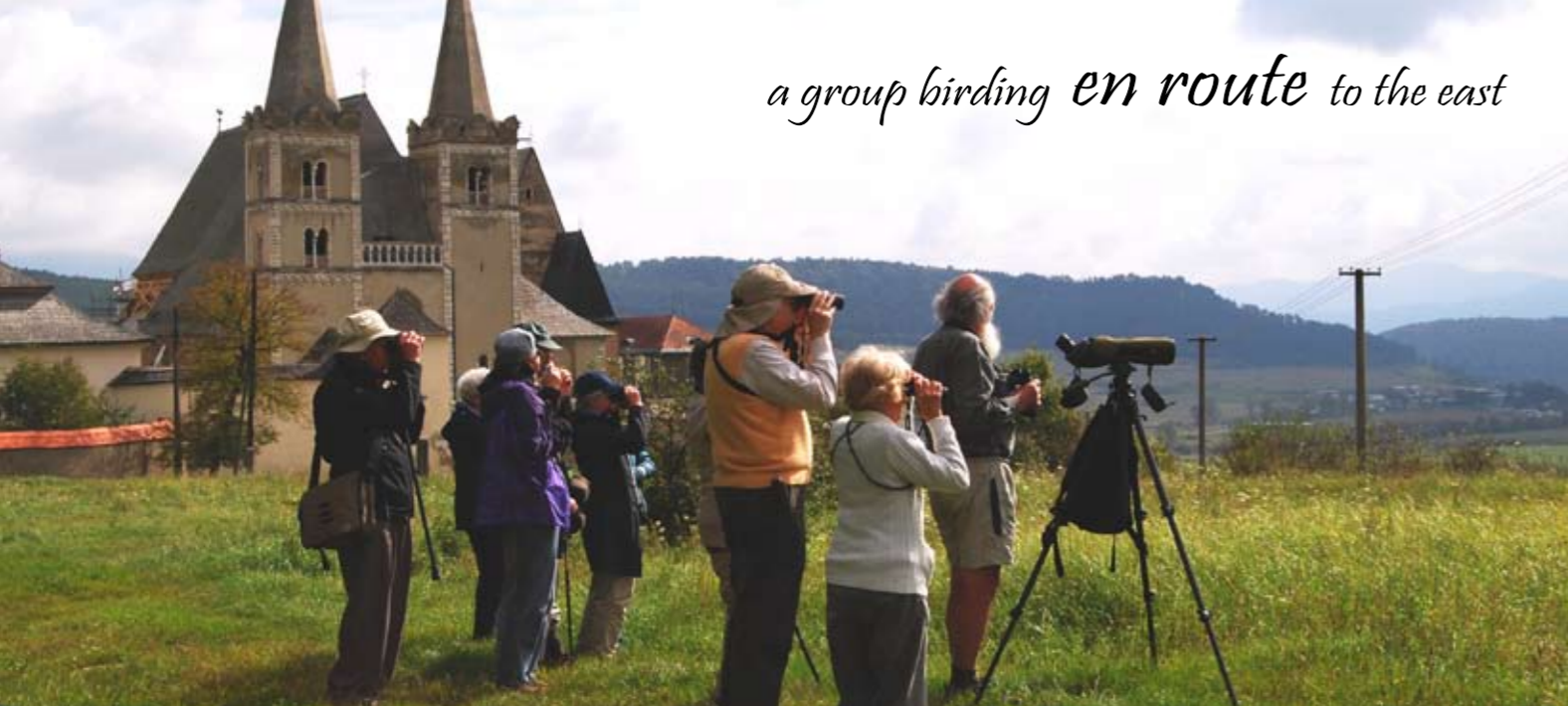
a group birding en route to the east