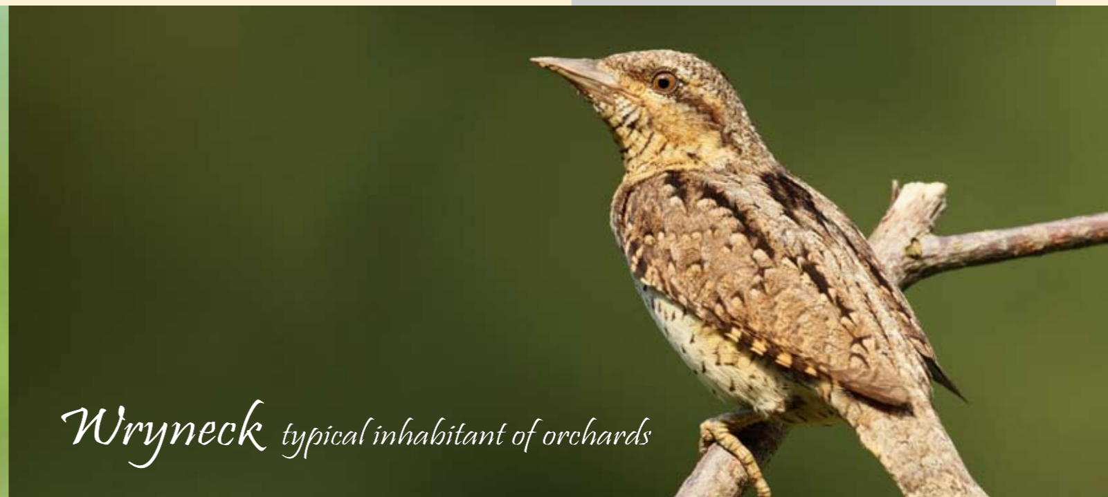
Wryneck typical inhabitant of orchards